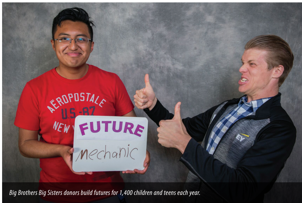
Big Brothers Big Sisters donors build futures for 1,400 children and teens each year.

Share Your Heart! Heart of Canal Street is Potawatomi Hotel & Casino's community program that raises funds for children's charities – and Big Brothers Big Sisters of Metro Milwaukee is a 2017 beneficiary.