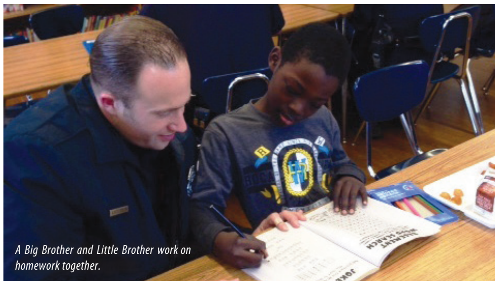
A Big Brother and Little Brother work on homework together.

Let's strike it BIG again in 2017! At Big Brothers Big Sisters, we love bowling – not only is it a great way to spend a fun-filled evening with friends and family, but it raises important funding for the children we serve every day! More information on Bowl for Kids' Sake is coming soon. We will post updates, including the 2017 schedule, on our Bowl for Kids' Sake website at gobowling.kintera.org .